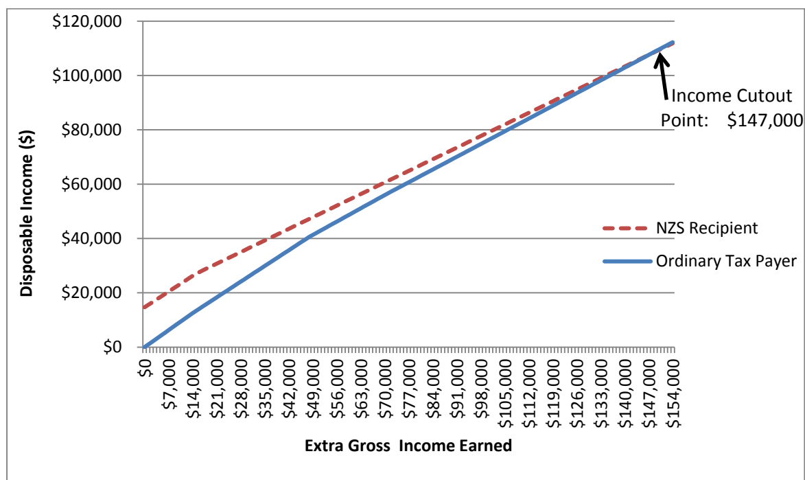
Figure 3: Scenario 2. Two-tiered rate of 17.5% (for first $15,000 earned) and 39% above $15,000

Given that for 80% of NZS recipients, NZS provides at least 55% of their income (Perry, 2009), a tiered structure may be useful to give some relief to those with limited extra income. Figure 3 illustrates a tiered scenario; with rates of 17.5% for the first $15,000 of other income, and 39% on each dollar above that. The break-even point in this case would be much higher than in Figure 2, at $147,000.